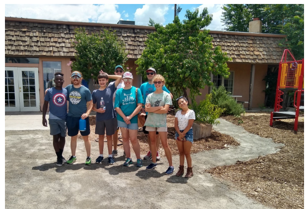
Friends from Hope Church in ABQ: a faithful and involved donor & partner of ECM since 2013!