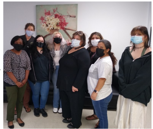
One Hope and Growing Awareness were fortunate to each have an intern this spring.

One Hope Centro de Vida is back to full operations! Our dental clinic opened in April, and we are booked solid, meeting the dental needs of our neighbors who were without care for over a year. We are back to in-patient services for our medical, women's, nutrition, and mental health clinics, and we serve as a clinical space for asylum seekers who must have an up-to-date physical for their asylum applications. We are also on the front line of vaccine education, coordination, and even some delivery, in addition to participating in vaccine hesitation studies and plans for community-wide vaccination campaigns. It is truly an exciting time for us!